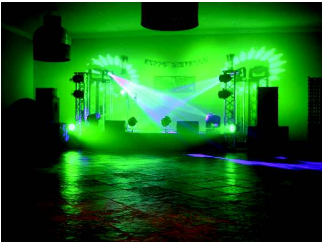
Elephant Acoustic Sound, Martin Lighting, LED Par's and Stage