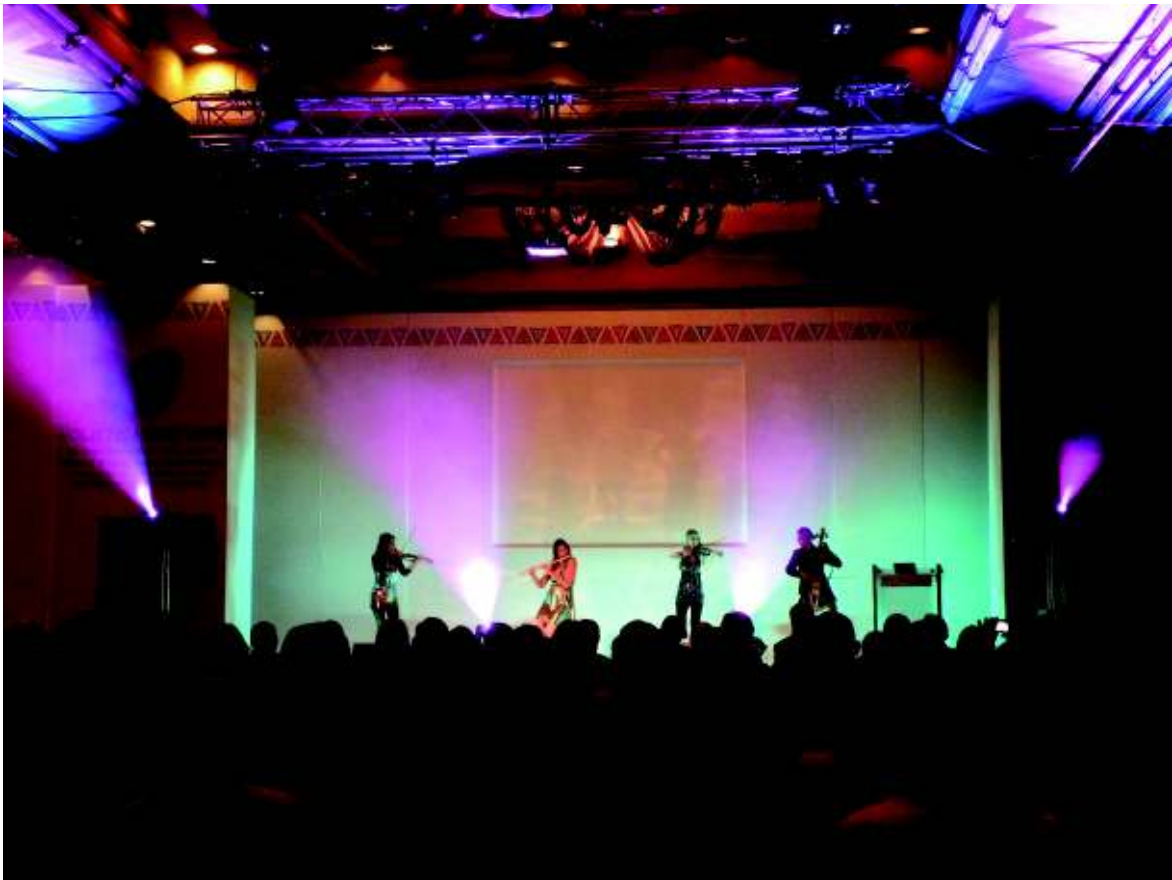
Sun City, Royal ball room, Elephant Acoustic Sound, Martin Lighting