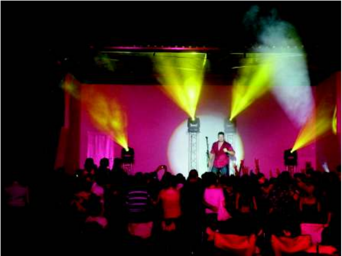
Nicholis Louw Live ( Sound and Lighting )