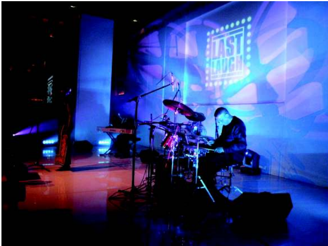
African Sunrise band at Sun City, Elephant Acoustic Sound, Martin Lighting