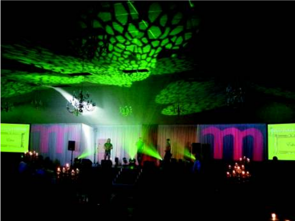
Corporate function, Custom gobo's ( red "m" ).